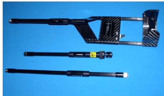
SnapOn Profiler head for a Pearpoint 494 camera/tractor unit

To assess the performance of the Profiler product in terms of the minimum requirements of the UK water industry and the specific claims of the manufacturer where these are exceeded.